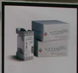
VITROS® Anti-HAV Total Assay Ortho-Clinical Diagnostics