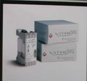
VITROS® Total \beta -hCG II Assay Ortho-Clinical Diagnostics