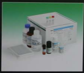
Bio-Rad Complete Hepatitis Product Line Bio-Rad Laboratories