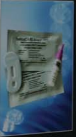
helicoCARE direct ARE diagnostica International