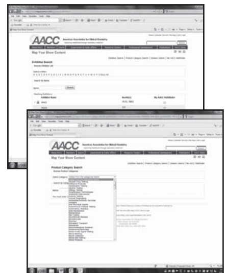
Here are screen shots to show you how easy it will be for website visitors to find you and your products.